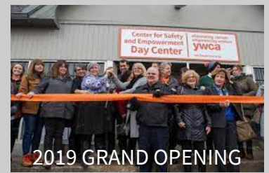
2019 GRAND OPENING

part of the services provided by the Center for Safety and Empowerment, serving over ## individuals so far in 2021.