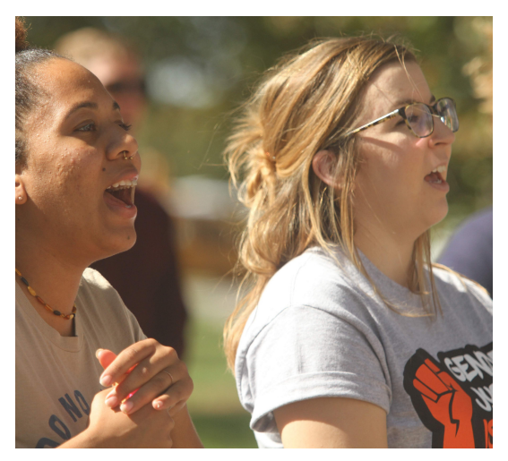
The greater Topeka community demands justice in a thousand different ways, and our voices rise together to do the work.

Since our founding, YWCA has been at the forefront of the issues that disproportionately affect women, girls, and people of color, from voting rights to healthcare to affordable housing.